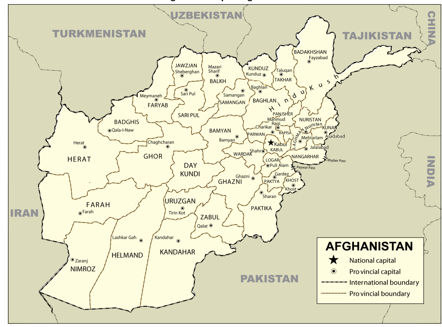
Figure A-I. Map of Afghanistan