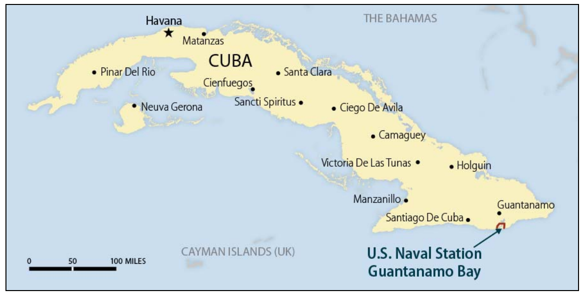
Figure I. Naval Station Guantanamo, Cuba

Source: By CRS using data from Esri. Map created by Bisola Momoh, Visual Information Specialist.