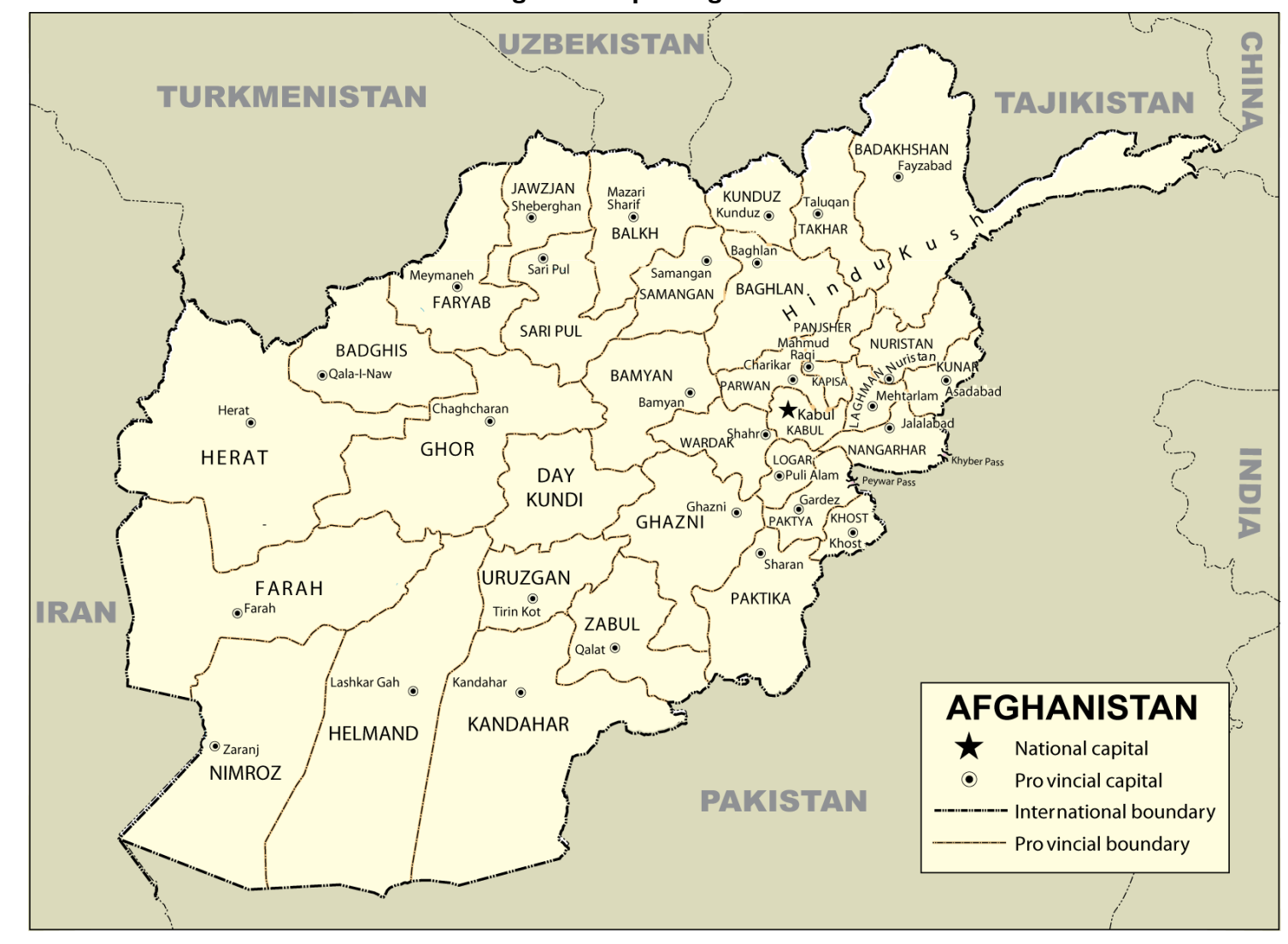
Figure I. Map of Afghanistan